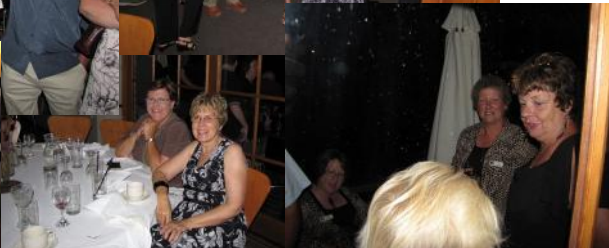
AGM - KazBar